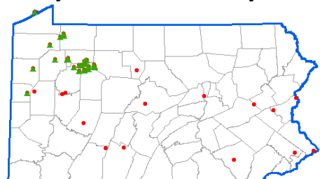
current data • records > 30 years old (1975) Pennsylvania Natural Heritage Program data 2005