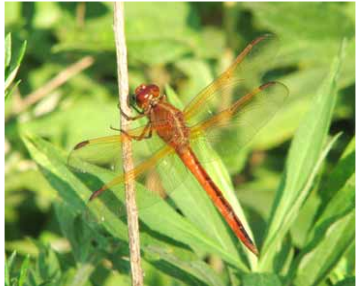
Needham's Skimmer ( Libellula needhami )

Found near coastal saltwater and brackish marshlands along the Atlantic and Gulf of Mexico shoreline from Texas north to Maine.