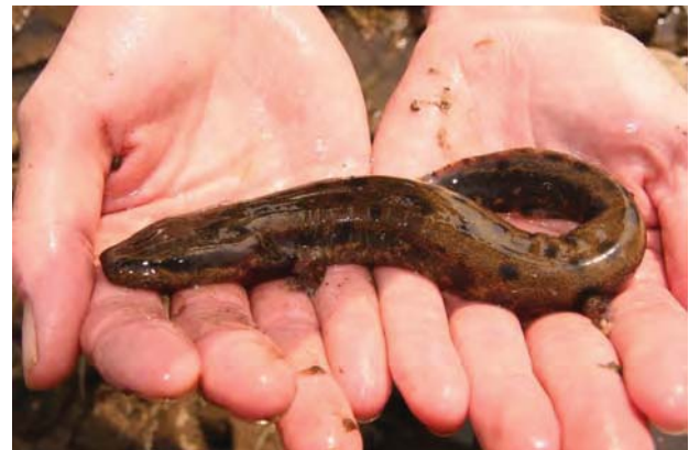
Charlie Eichelberger (PNHP)

The mudpuppy reaches sexual maturity at about 5 years of age and may live for nearly 30 years. Breeding takes place in the fall and nesting occurs the following spring. The female excavates a depression under a log or rock and deposits eggs on the underside of these overhanging structures. She tends the eggs until they hatch some two months later. The young, which have alternating yellow and brown stripes, remain in the nest another six to 8 weeks until they have absorbed their attached yolk sac. Juveniles tend to favor pools with silt and organic debris or a rocky retreat not already occupied by an adult salamander or fish. Mudpuppies are active year round.